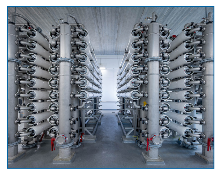
Pentair X-Flow Xiga Solution