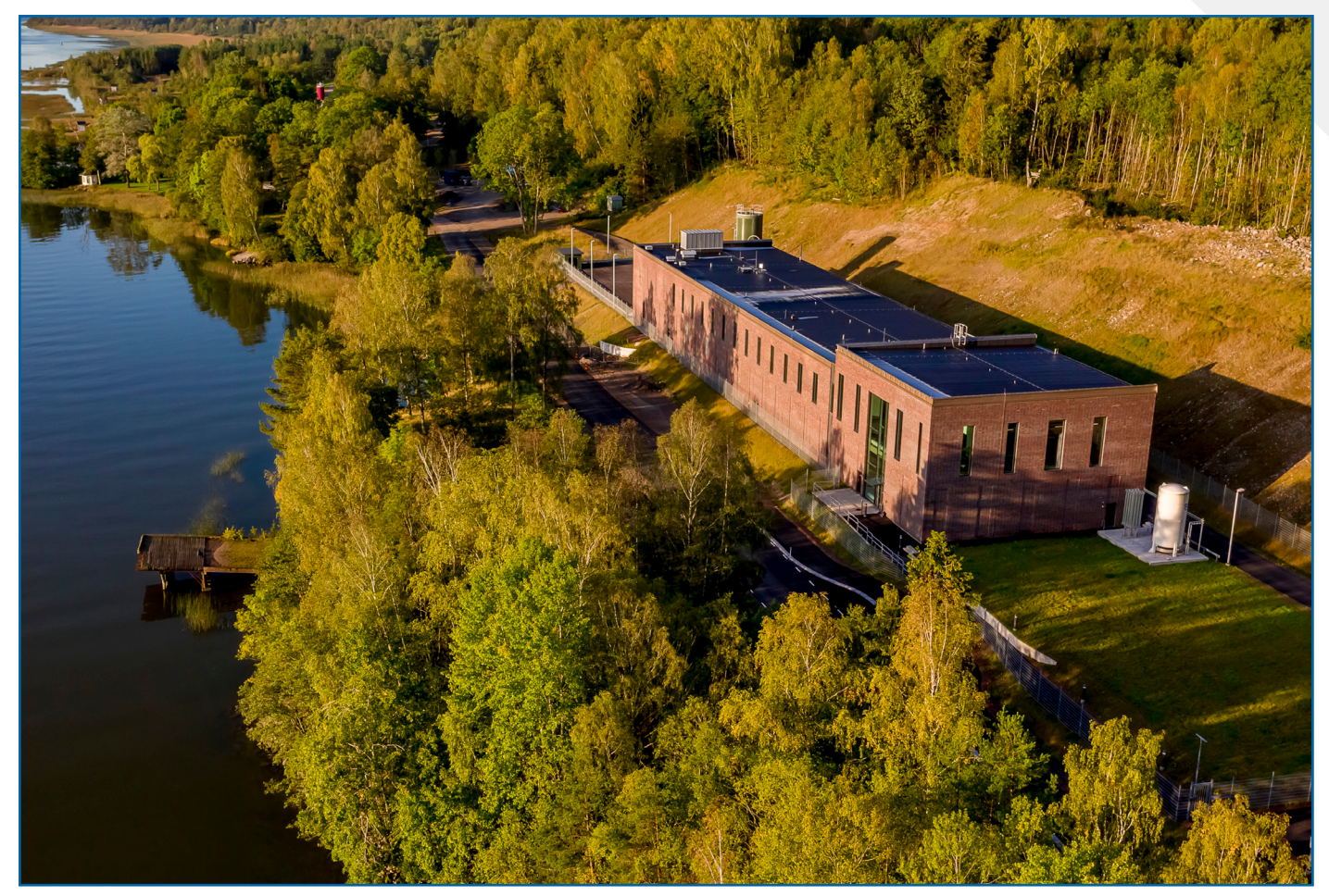
Drinking water plant in Kungälv